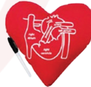
Visual Aid Diagram